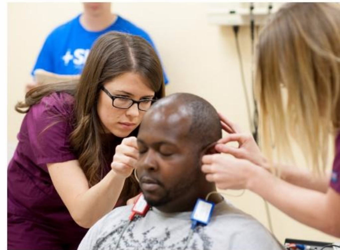
(ABOVE) STUDENT HEALTH OUTREACH FOR WELLNESS STUDENTS ASSIST AT A HOMELESS CLINIC

The ASU Refugee Empowerment Program serves newly arrived refugees in a culturally grounded manner that facilitates their integration into Arizona communities. (School of Social Work)