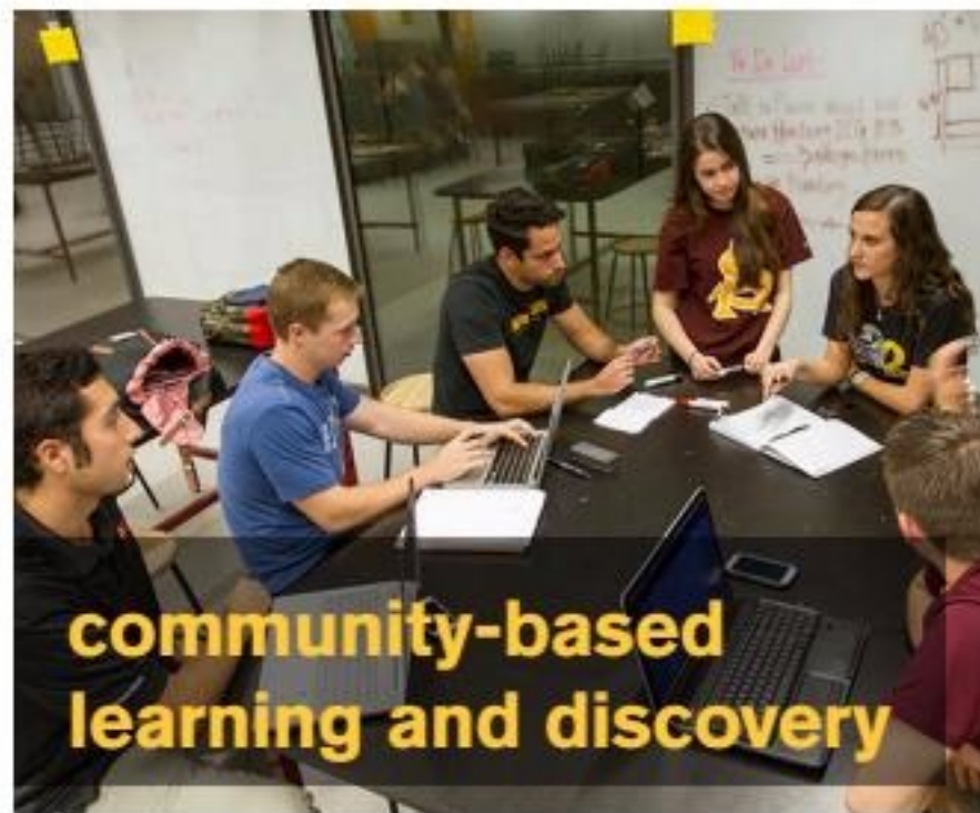
community-based learning and discovery

In response to pressing threats such as widespread chronic and acute disease, water-quality issues that impact public health and tragedies resulting from natural disaster and human conflict, The ASU Biodesign Institute develops effective and economical solutions through applied research and discovery. The Biodesign Institute has established 14 research centers, 42 patents, 541 inventions and 11 start-up companies or licensed technologies.