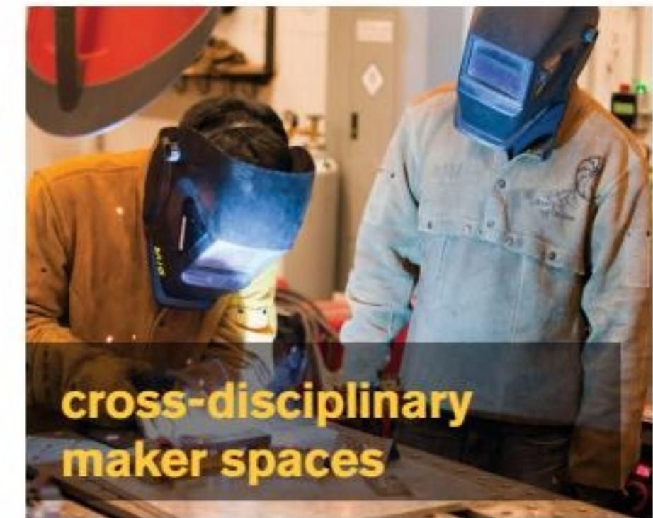
cross-disciplinary maker spaces

Changemaker Central @ ASU provides space, programming and community for and by entrepreneurial-minded students to drive social change in the local and global communities. Located at four ASU metro Phoenix campuses, Changemaker Central helps students to navigate the process of designing and launching their social ventures, to pursue high-impact careers and engage in community service.