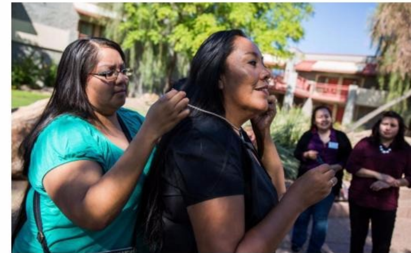
(ABOVE) A STUDENT PREPARES TO BE PHOTOGRAPHED FOR PROJECT DREAMCATCHER, A THUNDERBIRD FOR GOOD INITIATIVE

The Economic Club of Phoenix (ECP) is designed to enhance discussion of economic and business issues among academic, business, labor and public sectors in the Phoenix metropolitan area. (W. P. Carey School of Business)