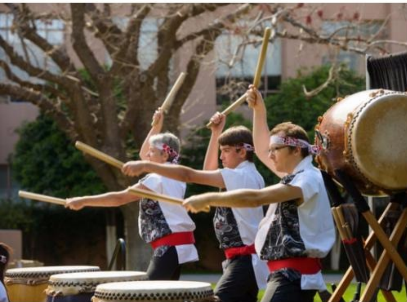
(ABOVE) STUDENTS PERFORM AT THE ANNUAL WORLD FESTIVAL

Student Health Outreach for Wellness (S.H.O.W.) Clinic is a service-learning program that provides free healthcare and health education in Phoenix. (College of Nursing and Health Innovation)