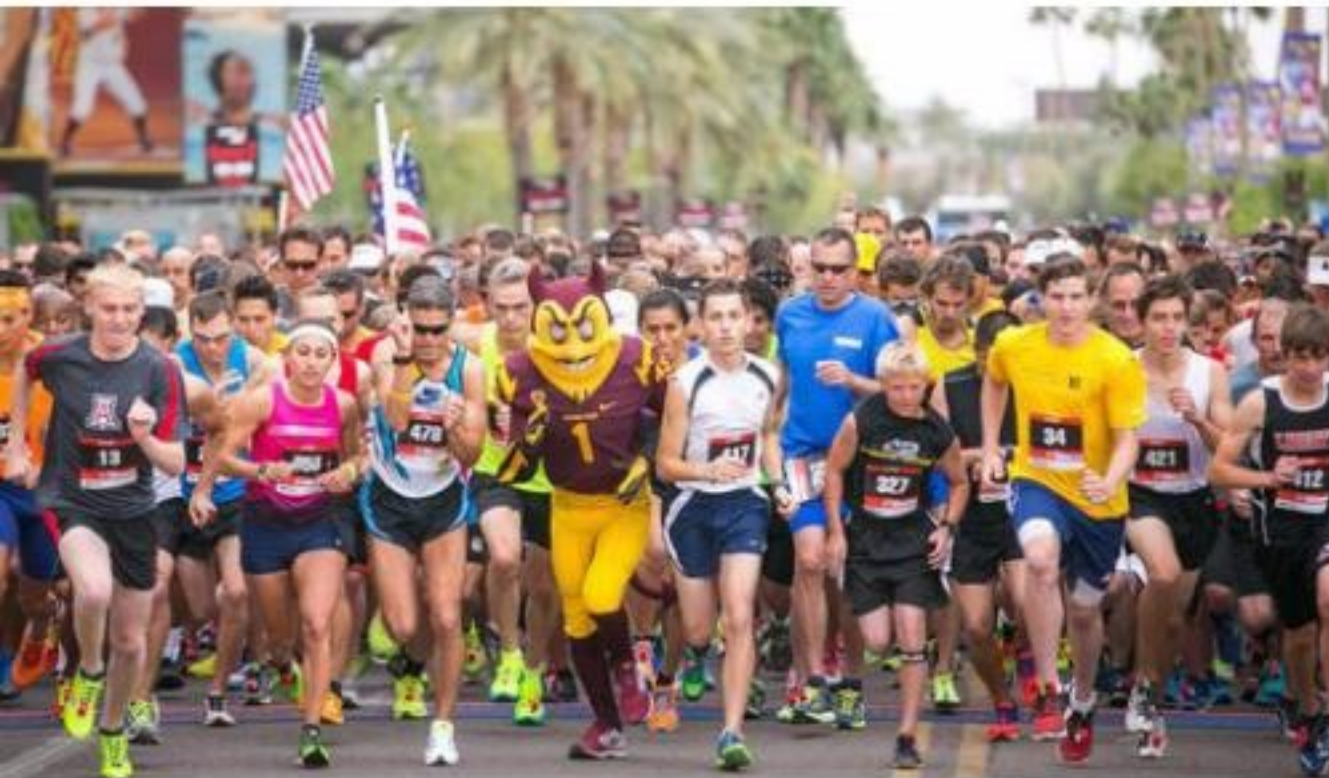
(ABOVE) THOUSANDS OF RUNNERS, WALKERS AND SPECTATORS MEET FOR PAT'S RUN IN TEMPE

U.S.-Pakistan Center for Advanced Studies in Energy focuses on applied research relevant to Pakistan's energy needs and serves as a bridge between the governments.