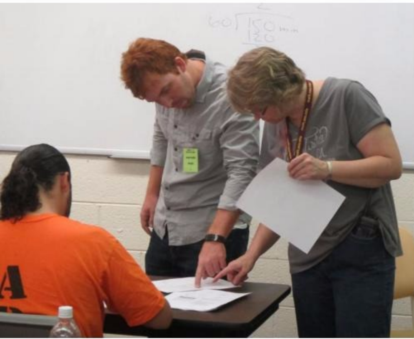
(ABOVE) ASU TEACHERS HELP AN INMATE WITH MATH HOMEWORK